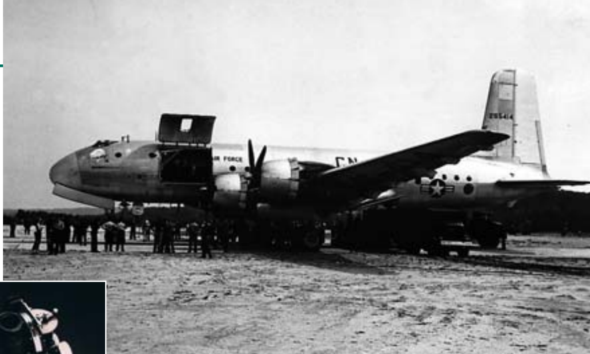
U.S. Air Force